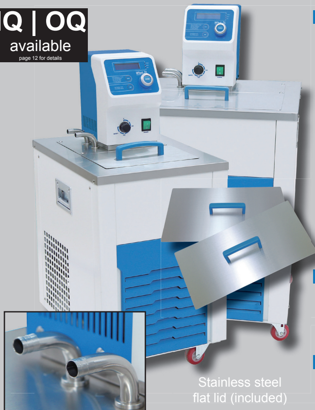
Stainless steel flat lid (included)

Connection for external circulation Ø12.5mm